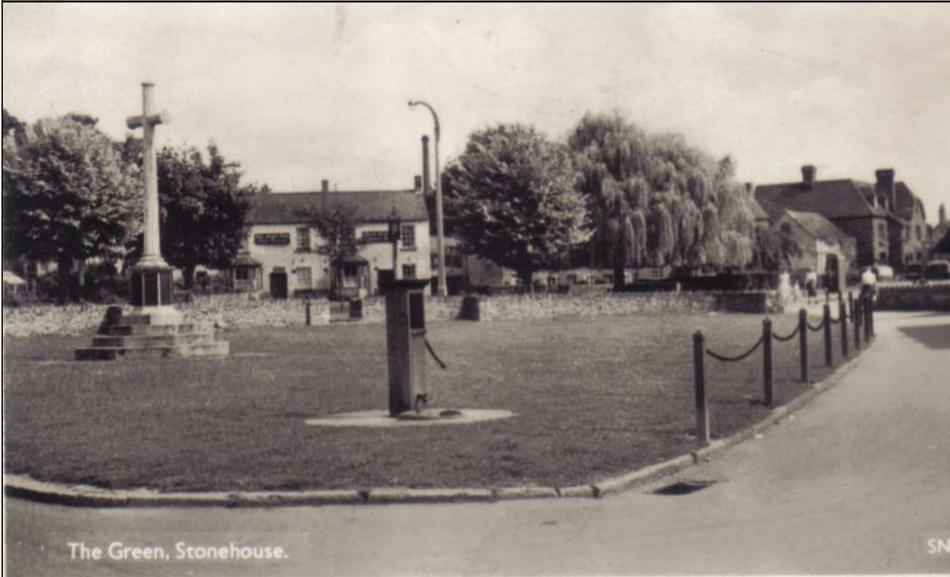
“Village greens” are numerous in and around Stonehouse. Beautifully maintained, they are jealously guarded by the residents who, in 1899, successfully fought a legal battle to retain ownership of them. Here, a fine willow graces Weeping Willow Tree Green