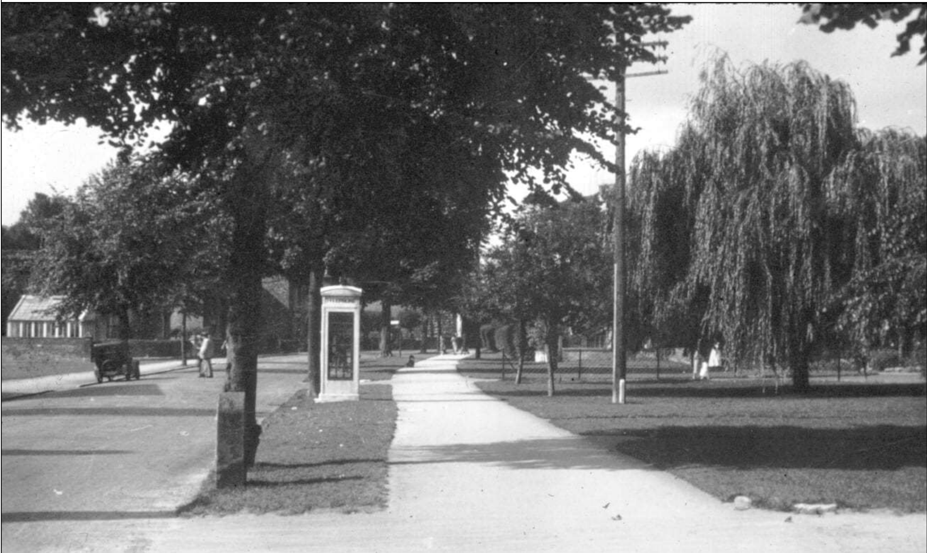
Late 1930s (photo left)