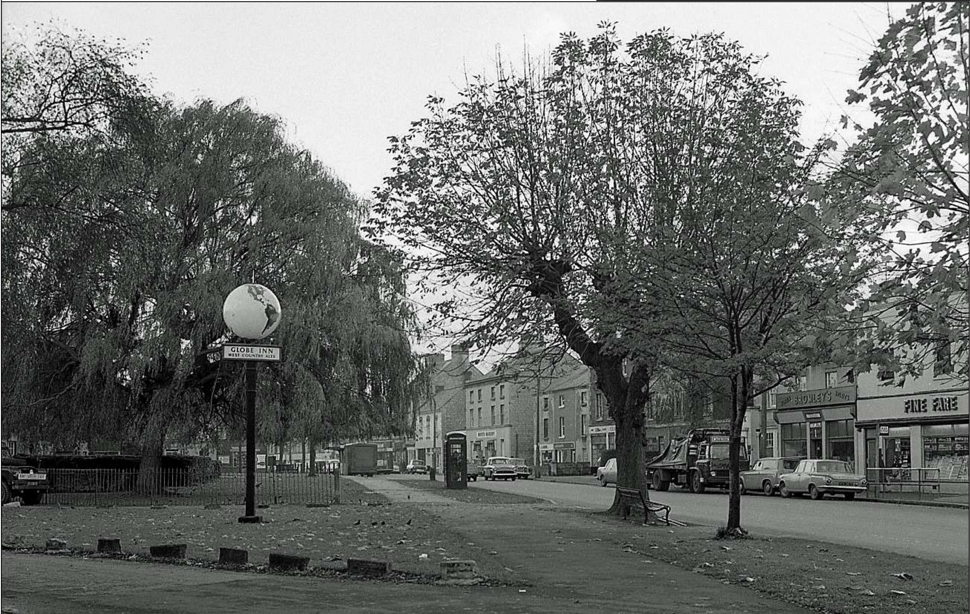
The willow tree and Globe Inn sign, 1970s.