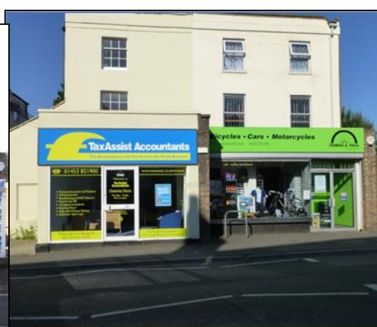
2013 TaxAssist Accountants