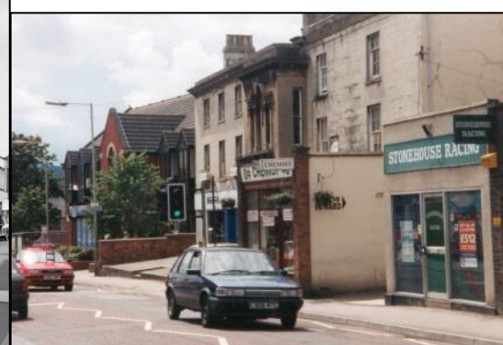
1997 Stonehouse Racing