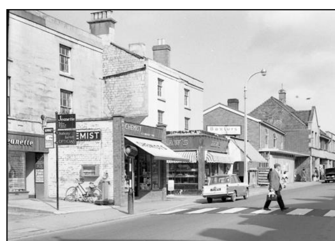
1970s Law's Fruit and Veg shop

Over the next 76 years the shop has been home to a variety of small businesses