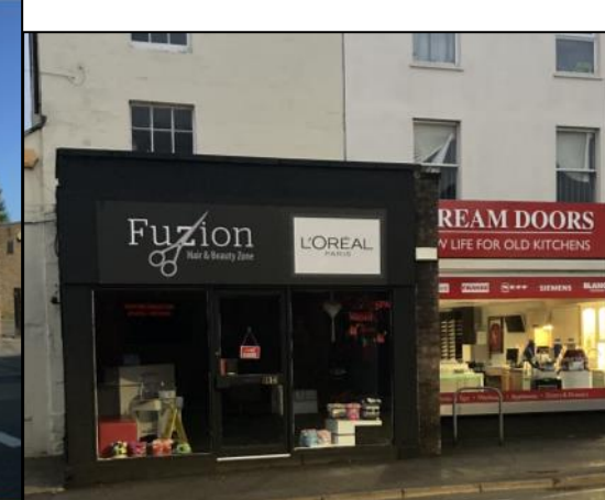
2022 Fuzion Hair and Beauty