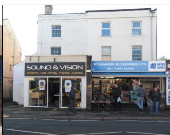
2010 Sound & Vision