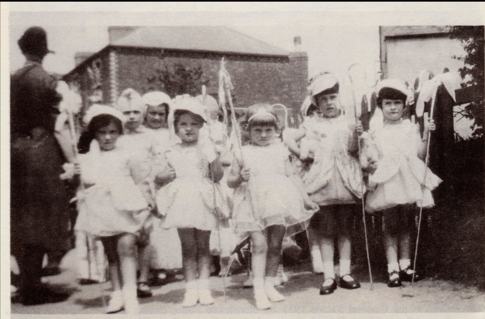
A delightful study of some of the younger competitors in the Silver Jubilee Fancy Dress Parade, 1935.