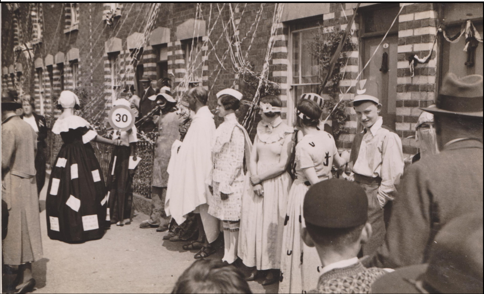
The Carnival Parade met at Woodcock Lane and walked along Gloucester Road to the Green, where prizes were given out. Then they went along to the Laburnum Recreation Field where the Sports were held.