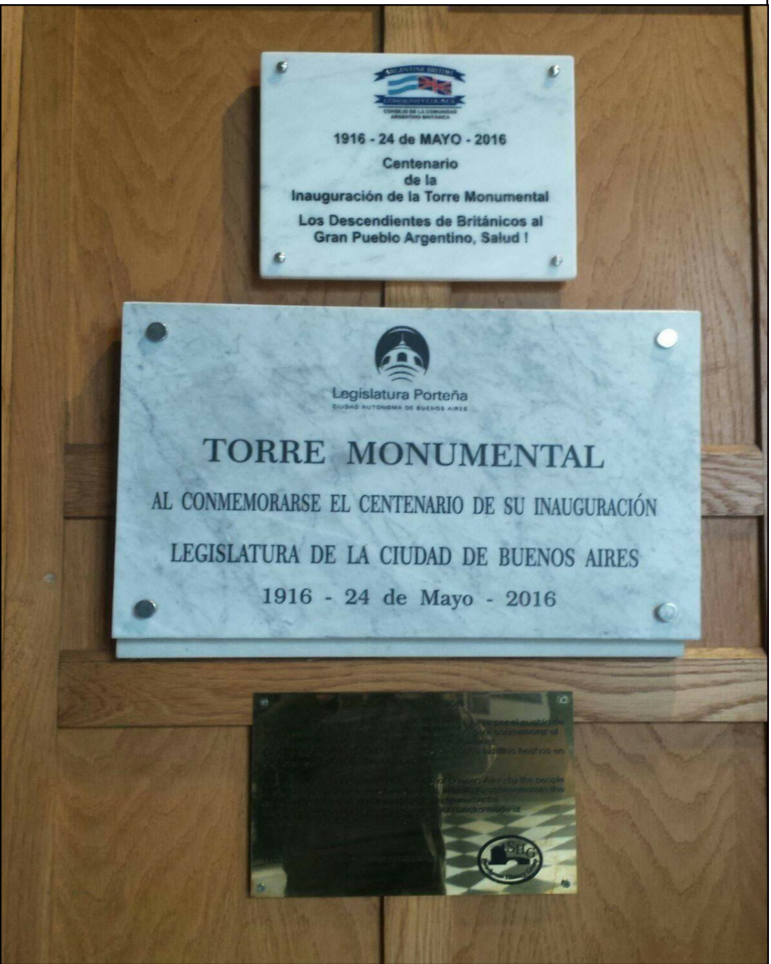
The plaque inside the Tower

In 2016, Stonehouse History Group decided to create a brass plaque to commemorate the tower's centenary and send it to Buenos Aires to fix at the base of the tower - from the people of Stonehouse to the people of Buenos Aires. The plaque was made, complete with inscription and SHG logo.