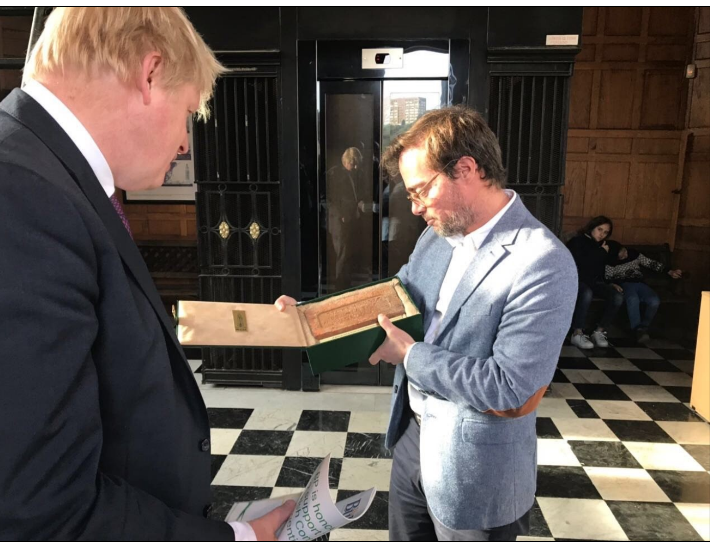
Boris Johnson is presented with the brick.