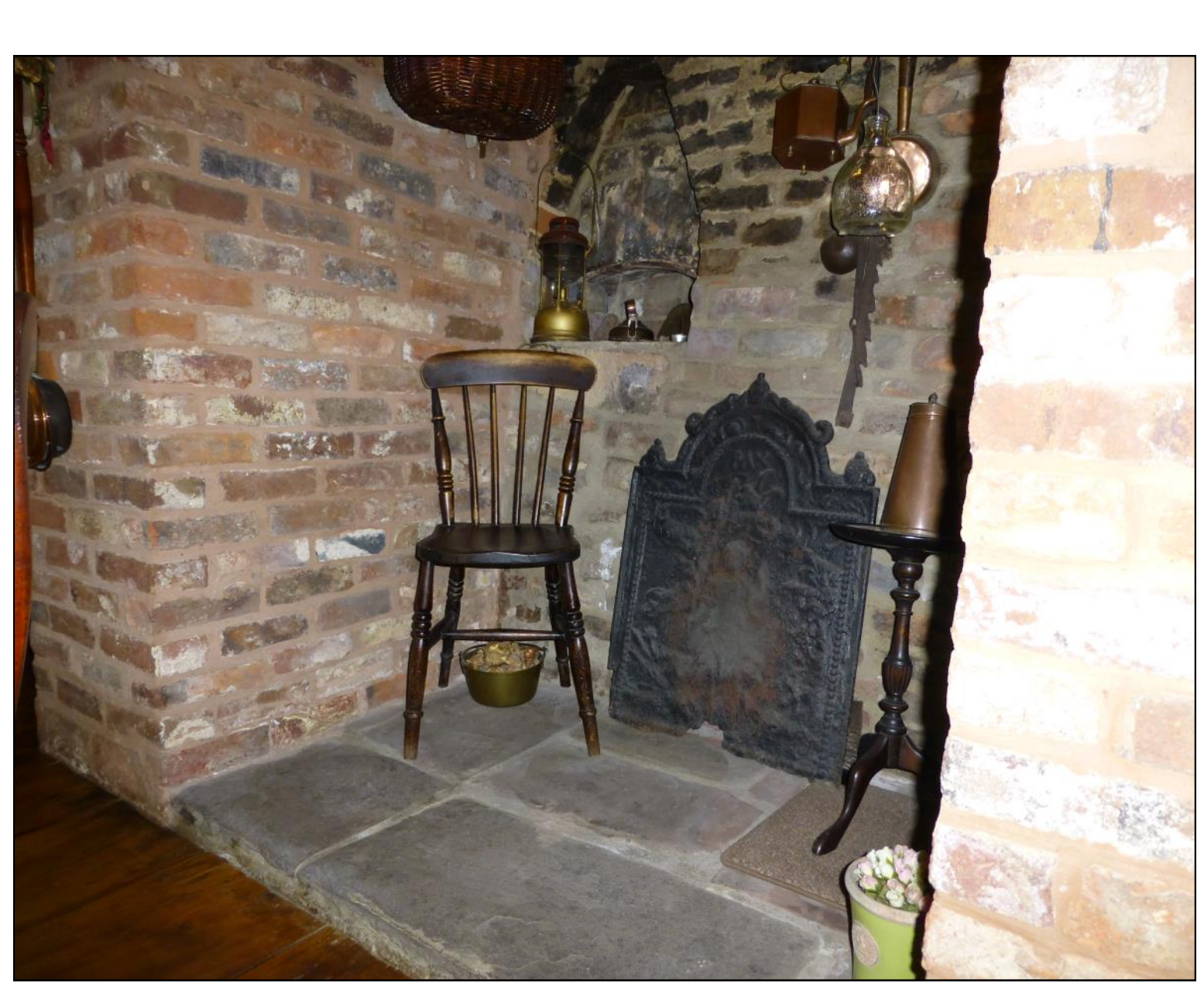
The inglenook fireplace with bread oven.

It has a fire plaque placed at the highest visible point on the cottage, underneath the eaves. The plaque indicates that the cottage was insured and the fire brigade would attend in case of fire.