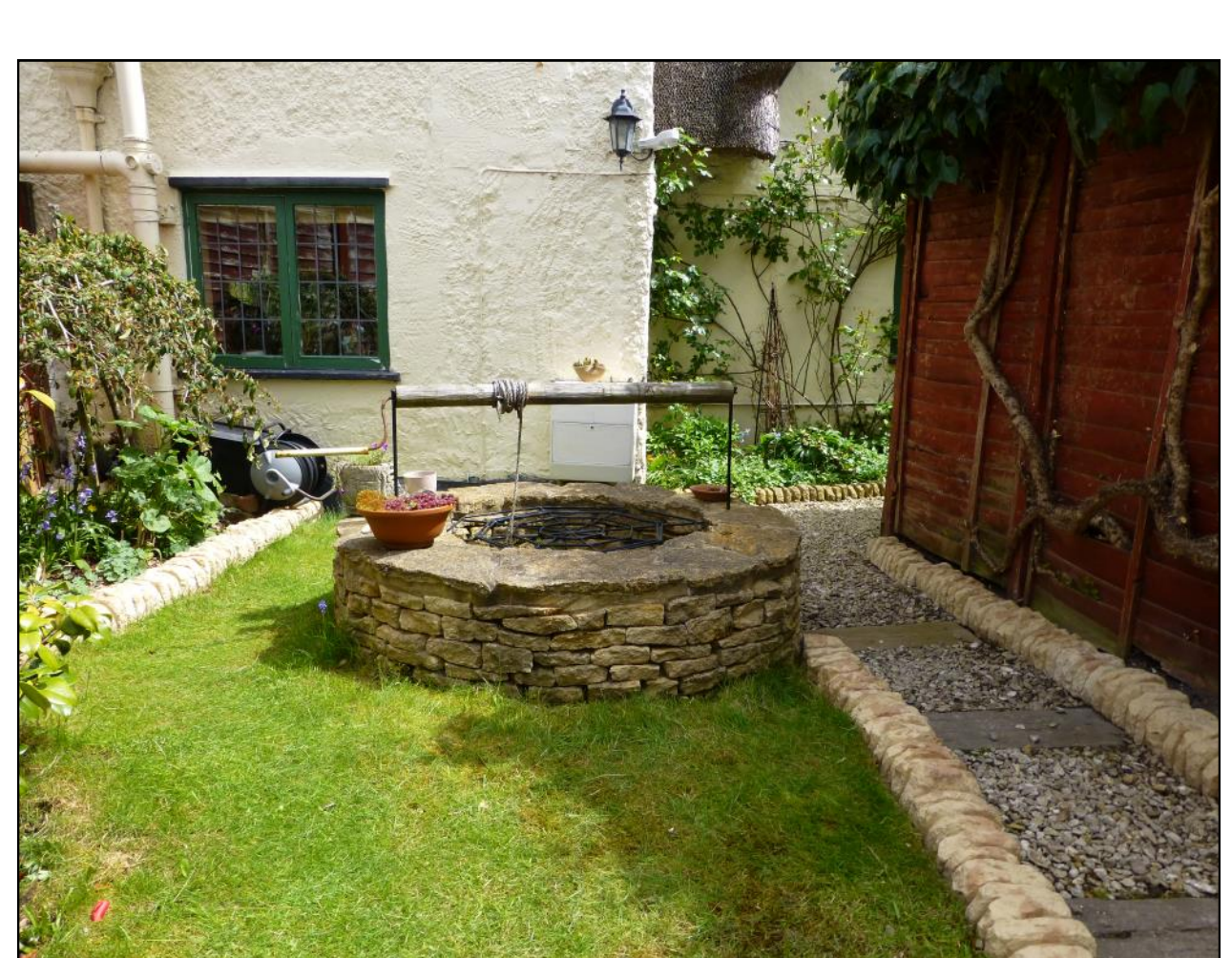
The original well in the garden.