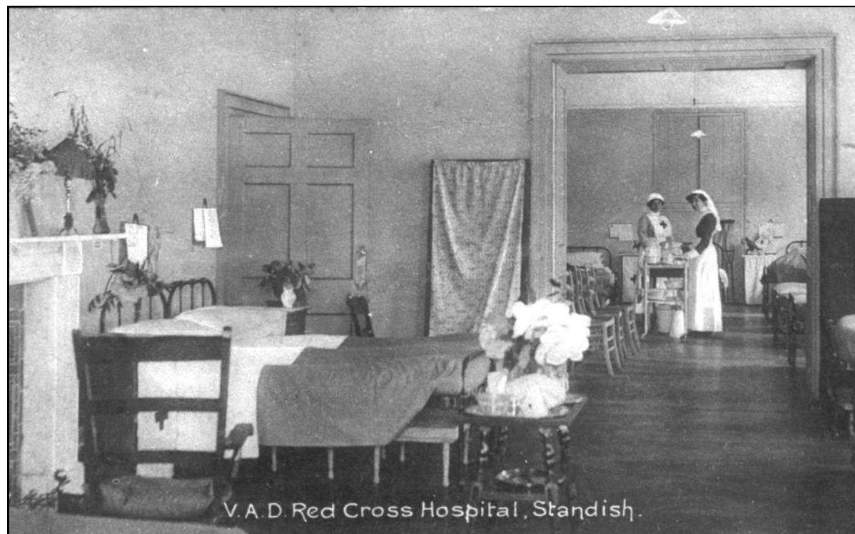
V.A.D. Red Cross Hospital, Standish.