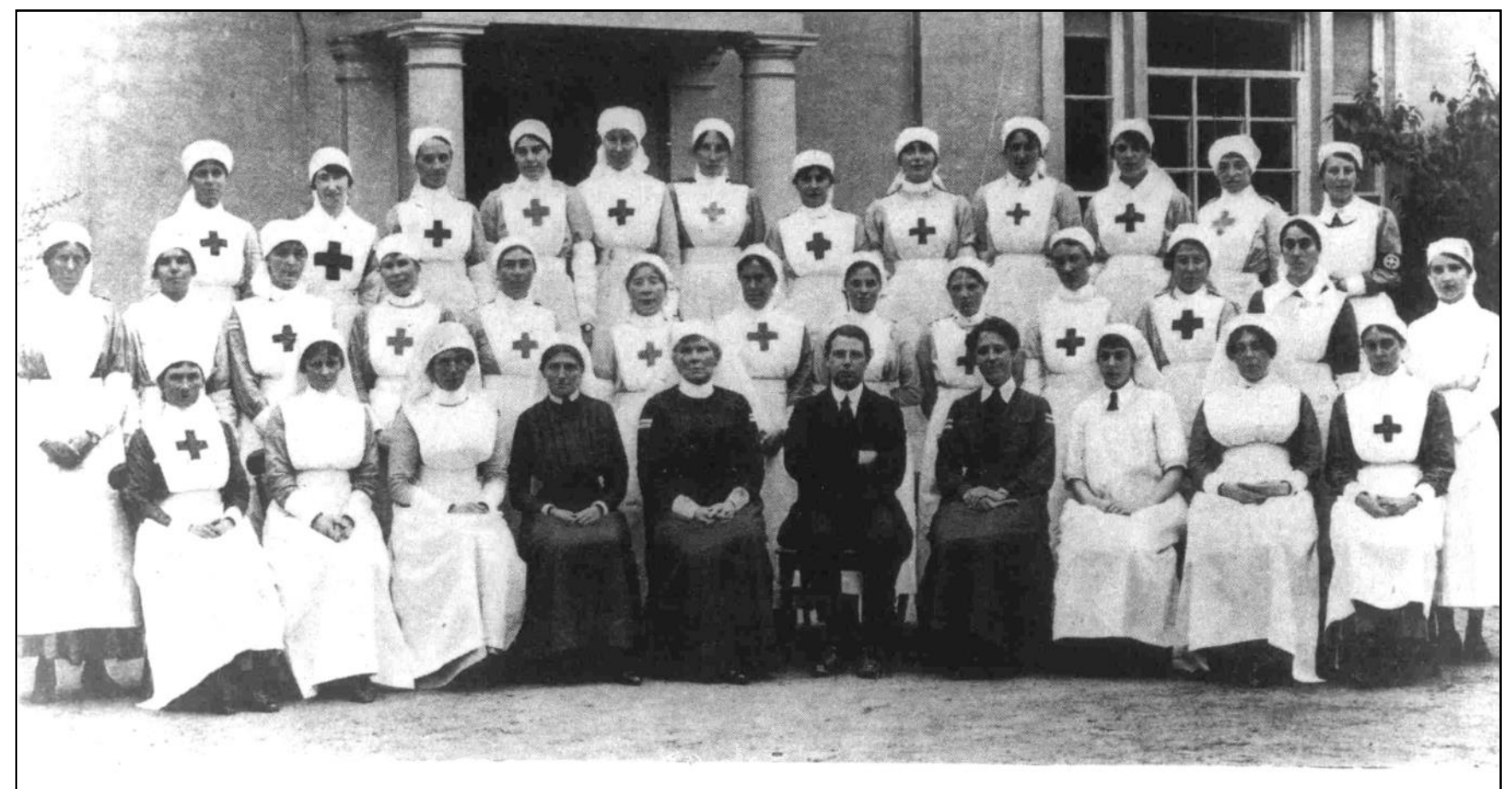
THE RESIDENT MEDICAL OFFICER, STAFF, SISTERS AND V.A.D. NURSES.