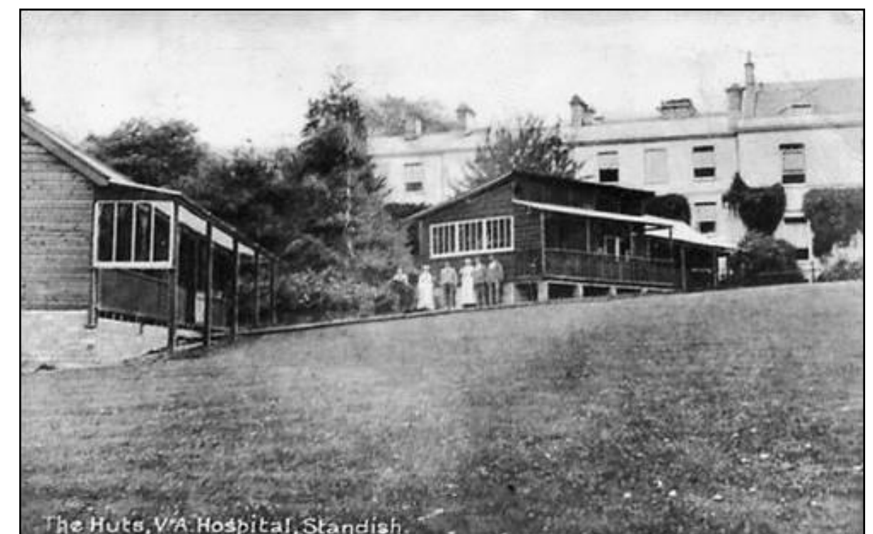
The Huts, V.A. Hospital, Standish.

Standish House Hospital opened on 13 th May 1915