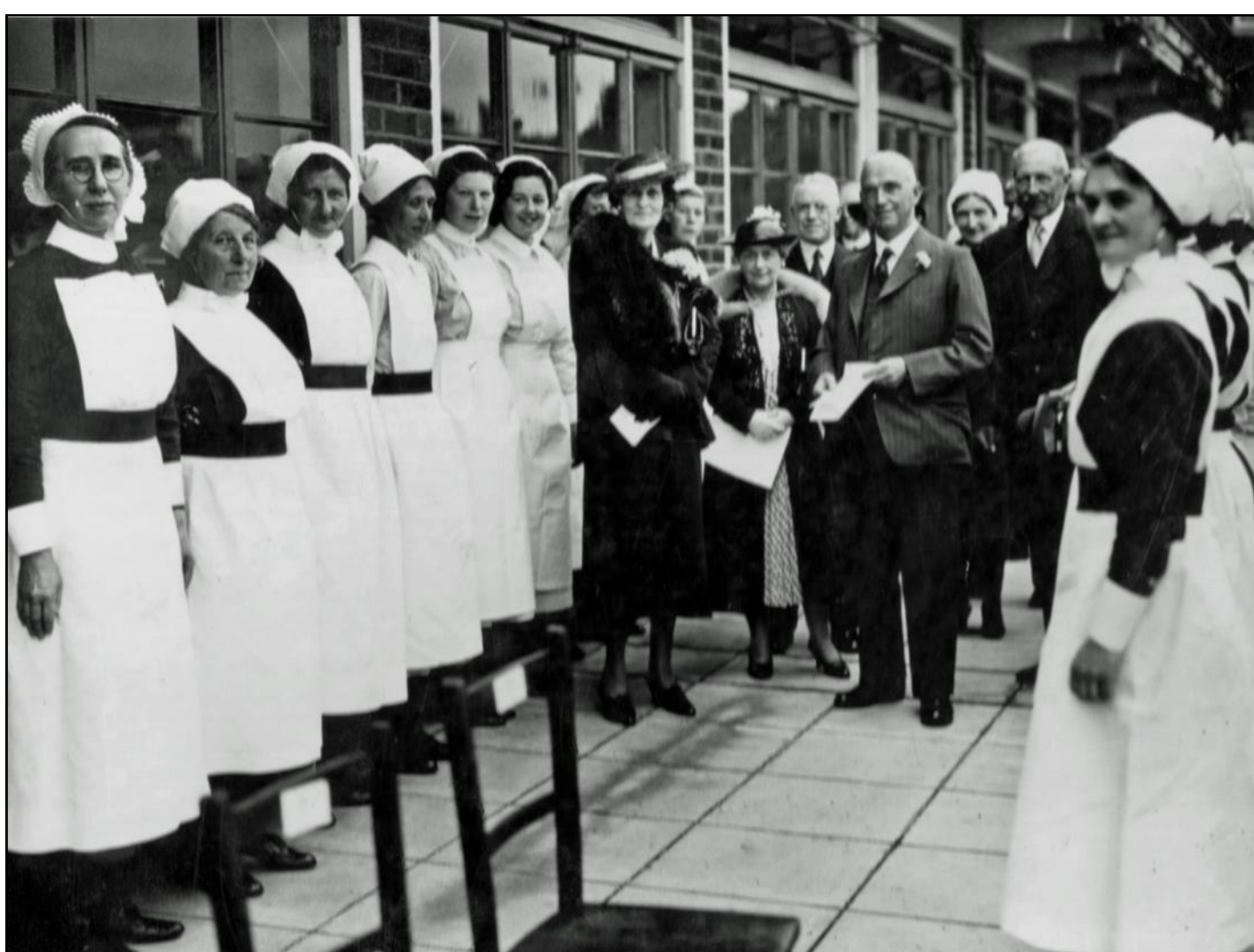
Opening of E Block in 1939 by Sir Frederick Cripps