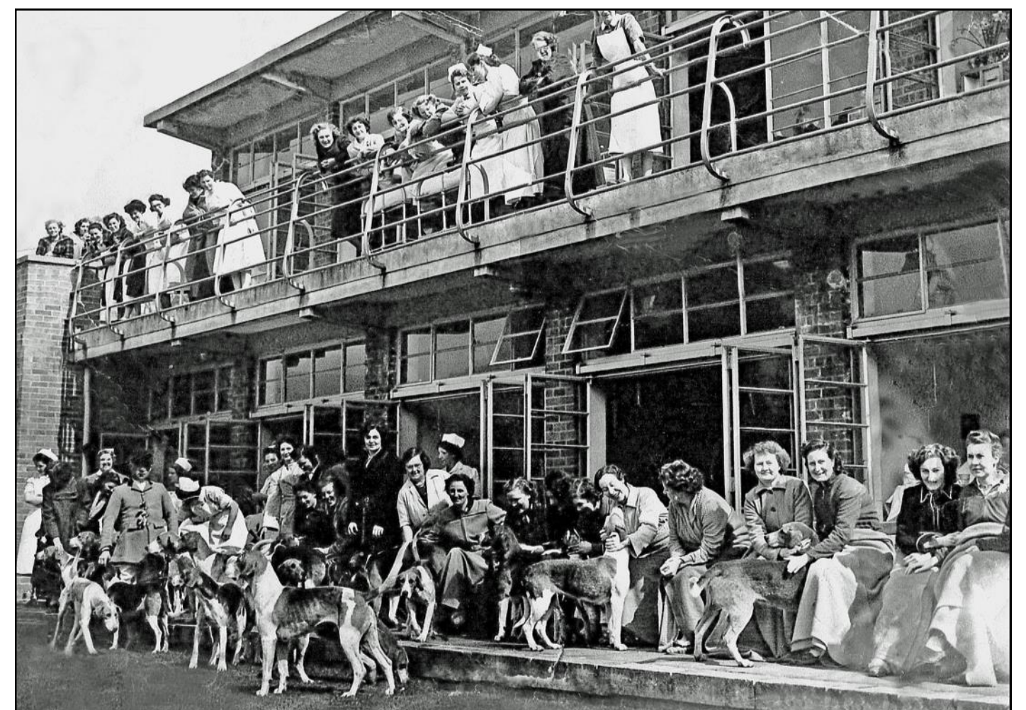
Members of Berkeley Hunt visited every year