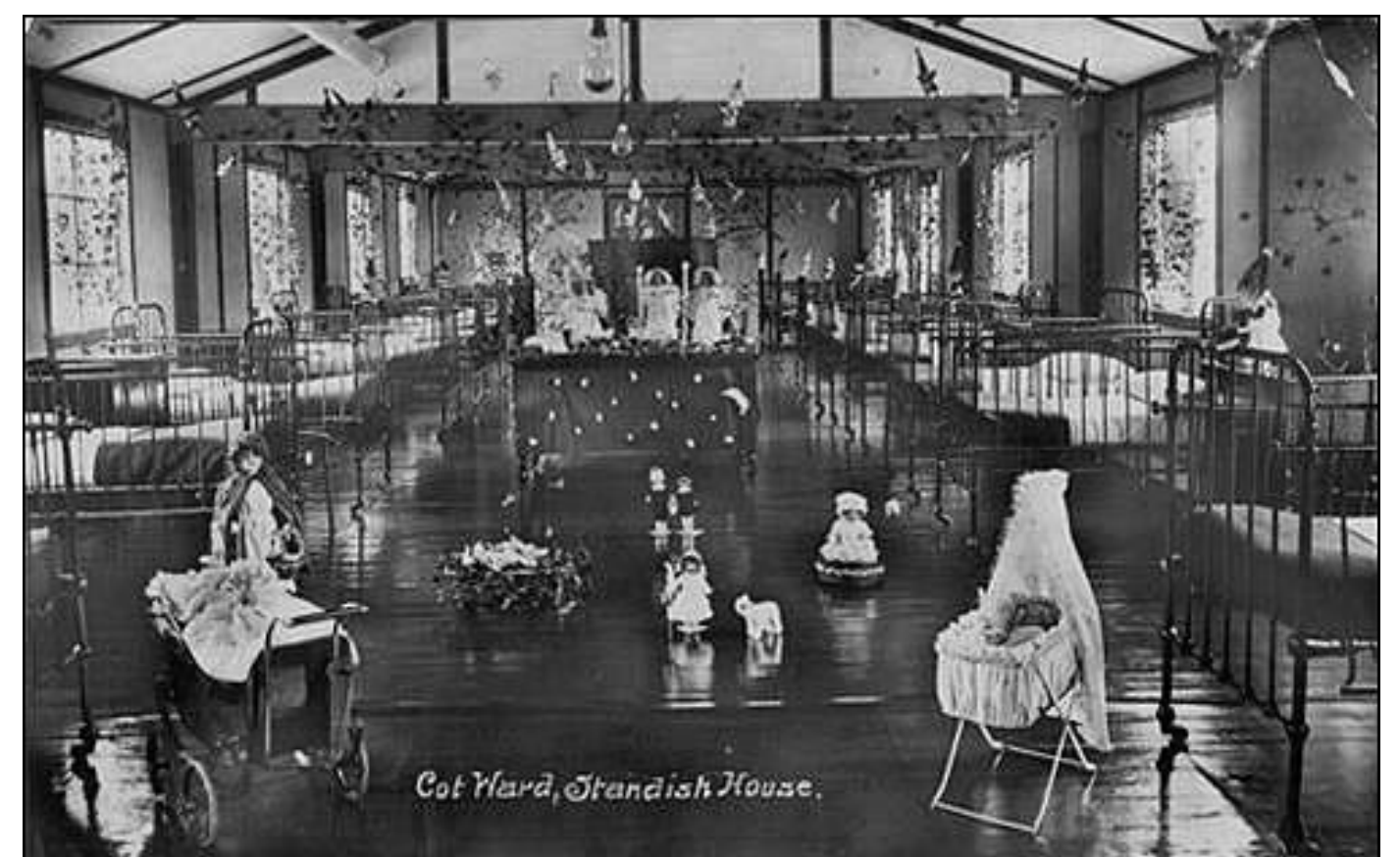
Children's ward decorated for Christmas