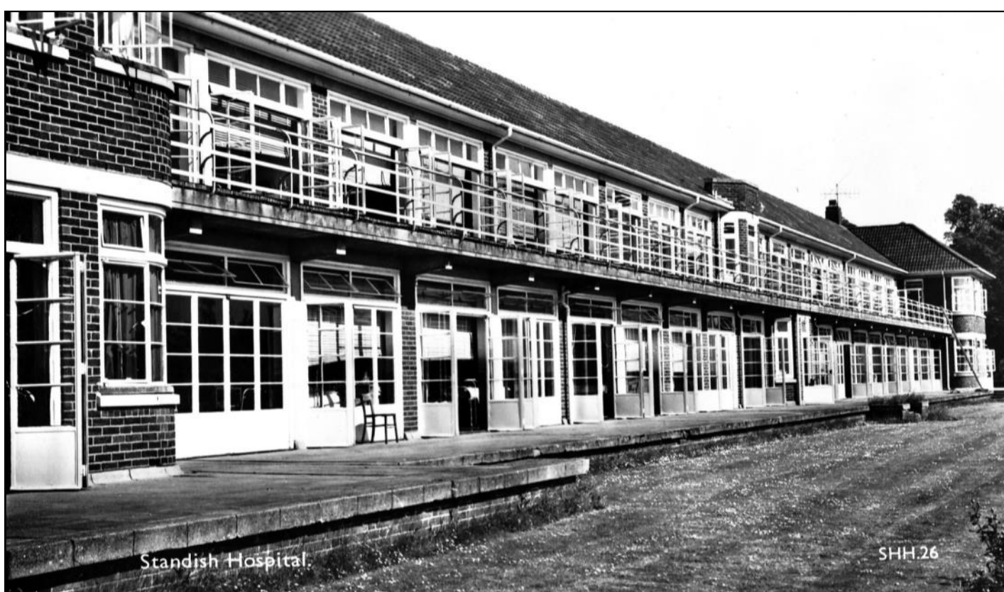
E Block opened June 1939