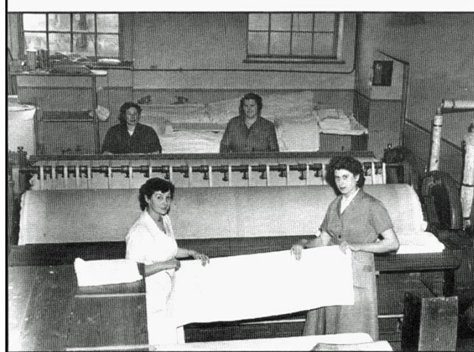
The Laundry Room.