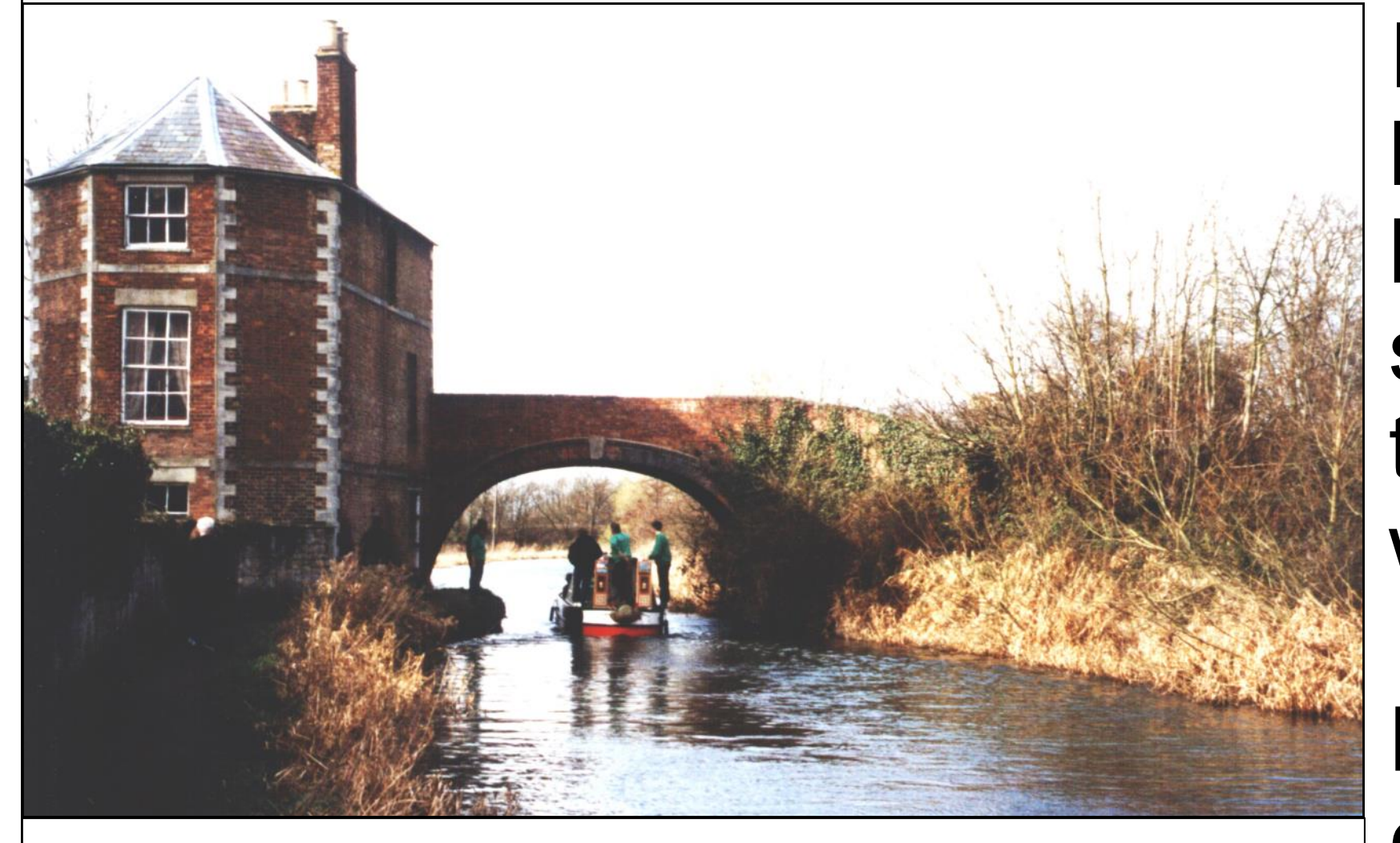
View of House and Canal 2000

Before April 1803 he built Nutshell Cottage on the Company's land to the west of the Bridge - without their permission.