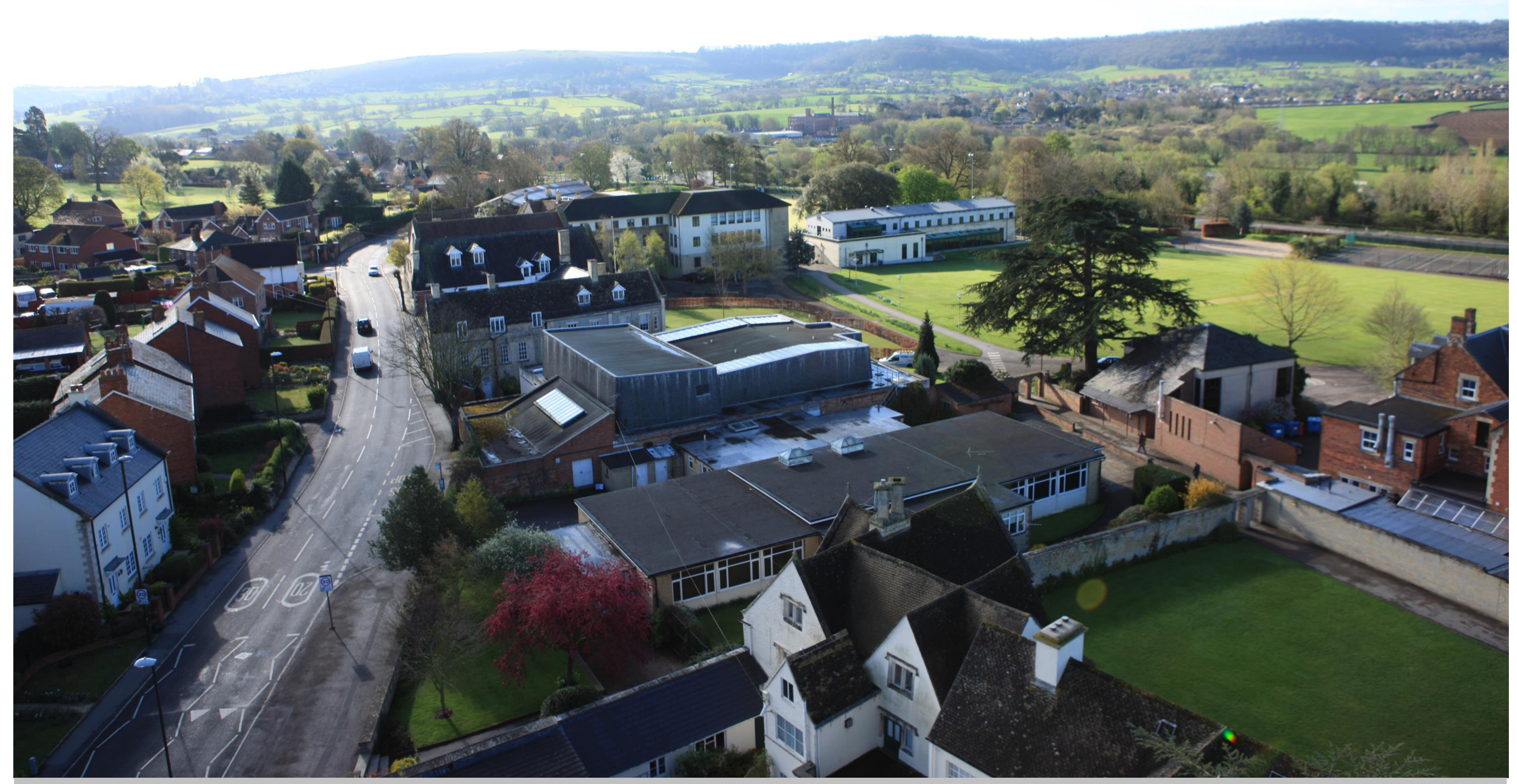
View across the Wycliffe College campus from the top of the Chapel spire. Ivy Grove in foreground