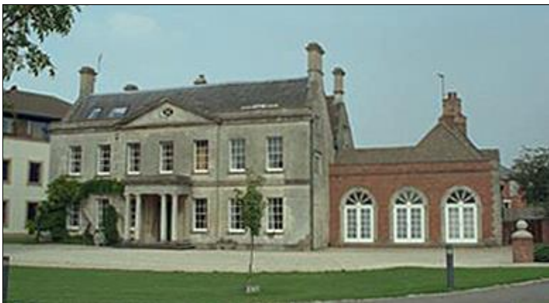
Haywardsend House in 2000