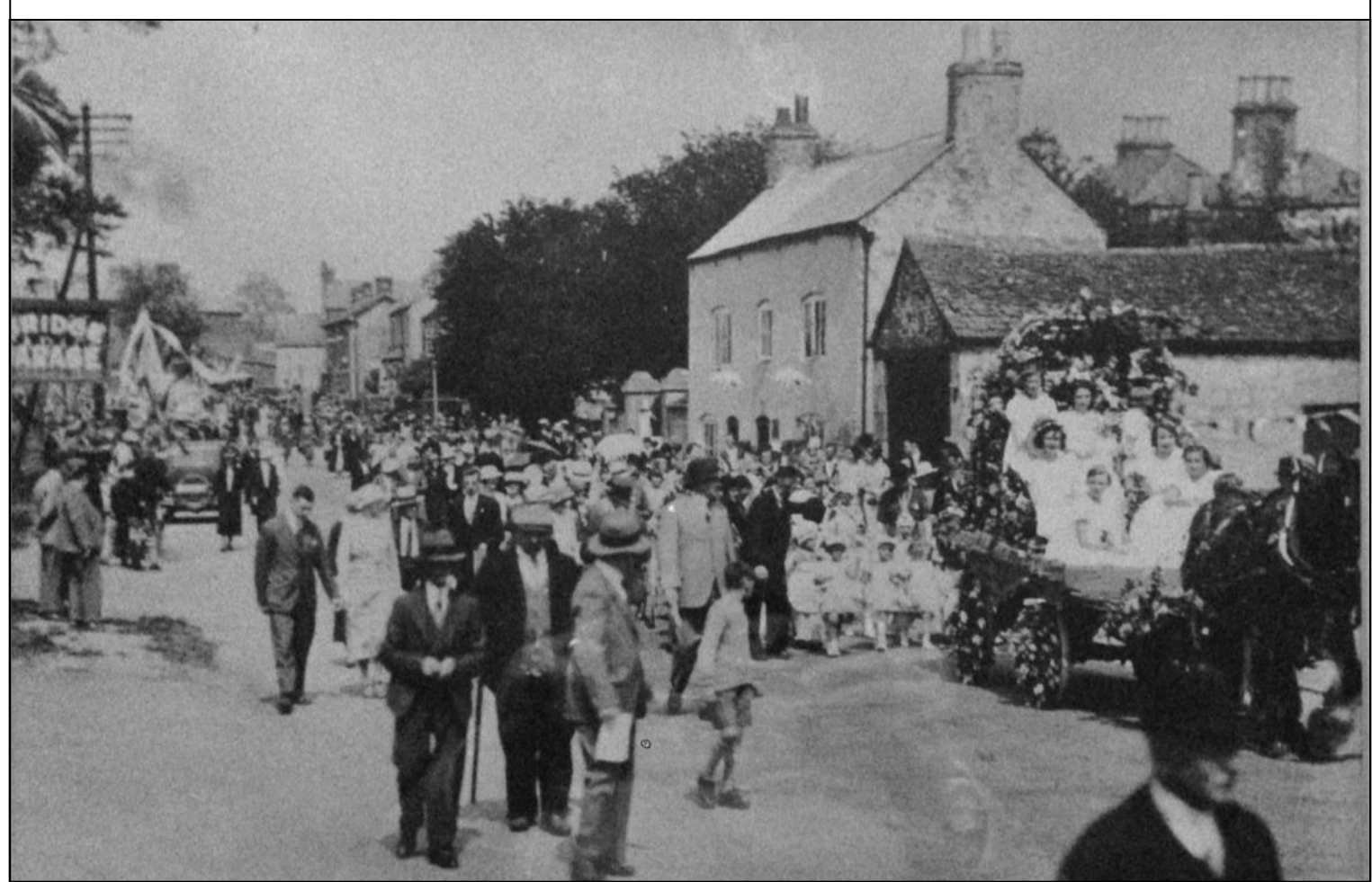
The Carnival Procession on Gloucester Road.

There were celebrations for the Silver Jubilee of King George V and Queen Mary in 1935. A full included a Carnival programme Procession, sports events, Concert Party and a Dance at the Subscription Rooms, and a firework display in Verney Fields followed by lighting the Beacon Fire on Doverow Hill.