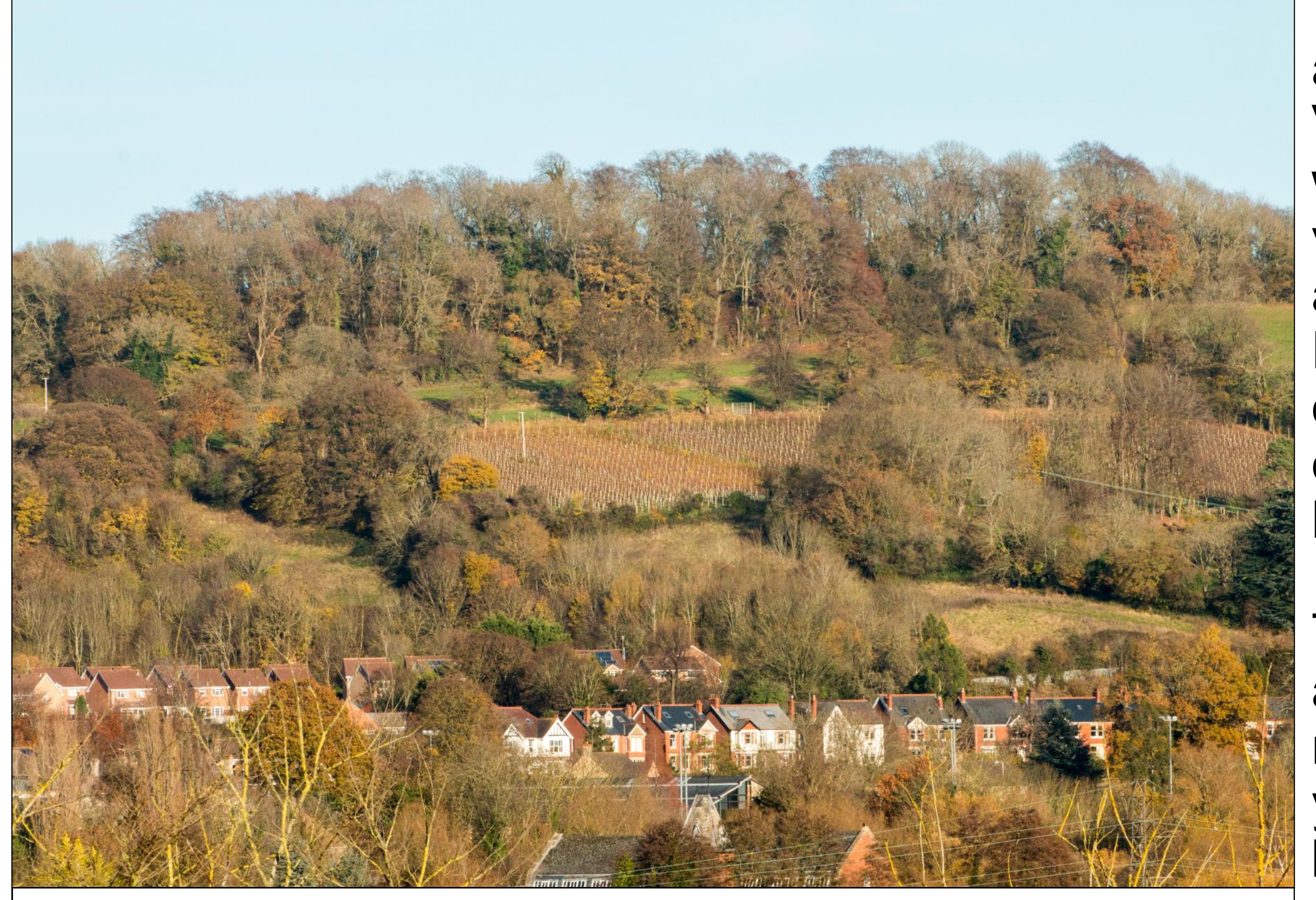
The vineyard in autumn sun.

In 2013 vines returned to Stonehouse as part of the Woodchester Valley Vineyard group, which produces white, rosé and sparkling wines. The vines enjoy the same southerly aspect in the Frome Valley as the Domesday vineyard did, but this time on the slopes of Doverow Hill, and over an area of about 25 acres, or 10 hectares.