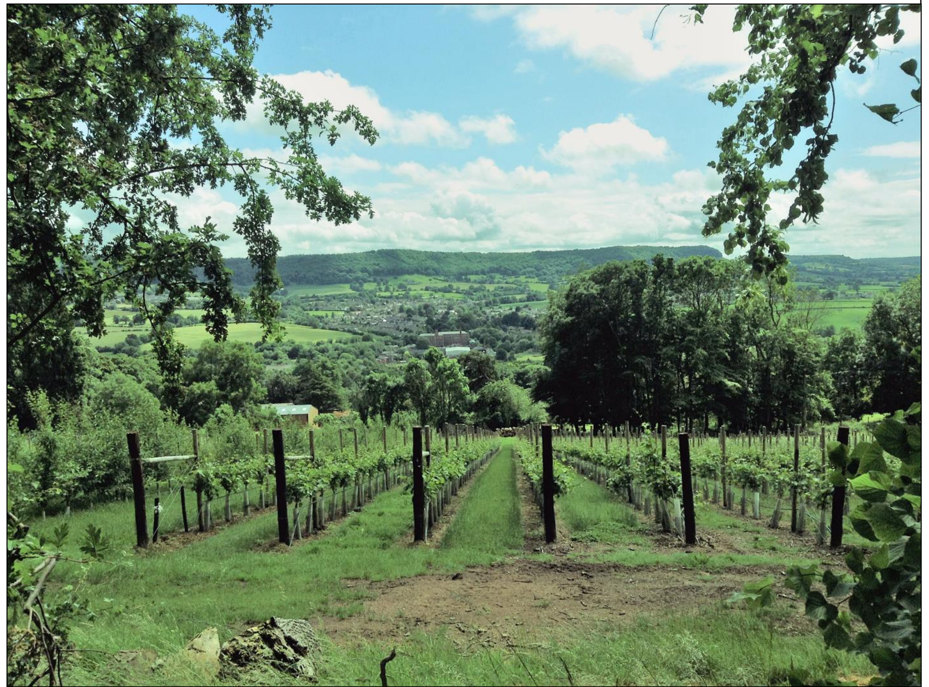
Woodchester Valley Vineyard, looking south from Doverow Hill, summer 2016.

William of Malmesbury wrote in about 1125 that the wines from the Vale of Gloucester were of a comparable sweetness to those from France. Wine production is thought to have declined in England from the 13<sup>th</sup> century onwards, perhaps due to a changing climate, or to good supplies of French wines The gentleman traveller Fynes Moryson wrote in the early 17<sup>th</sup> century that 'in Glostershire, they made Wine of old, which no doubt many parts would yeeld at this day, but that the inhabitants forbeare to plant Vines, aswell because they are served plentifully, and at a good rate with French wines, as for that the hilles most fit to beare Grapes, yeeld more commoditie by feeding of Sheepe and Cattell.'