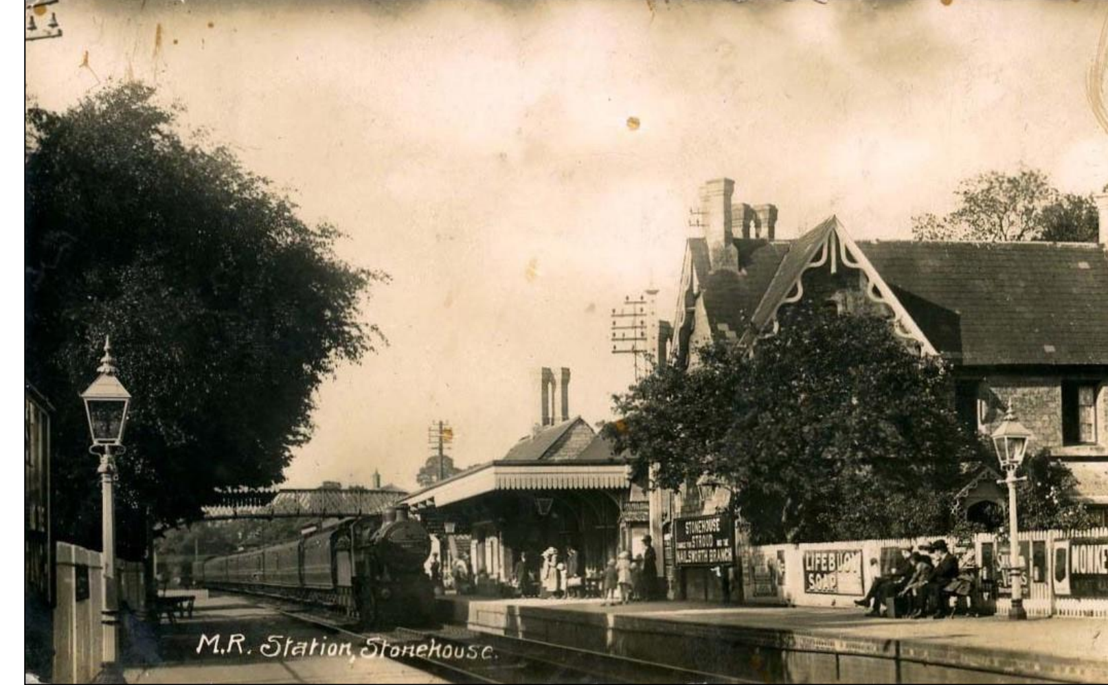
Stonehouse 'Midland Railway' station, on a card posted in 1926: the line became part of the LMS in 1923.