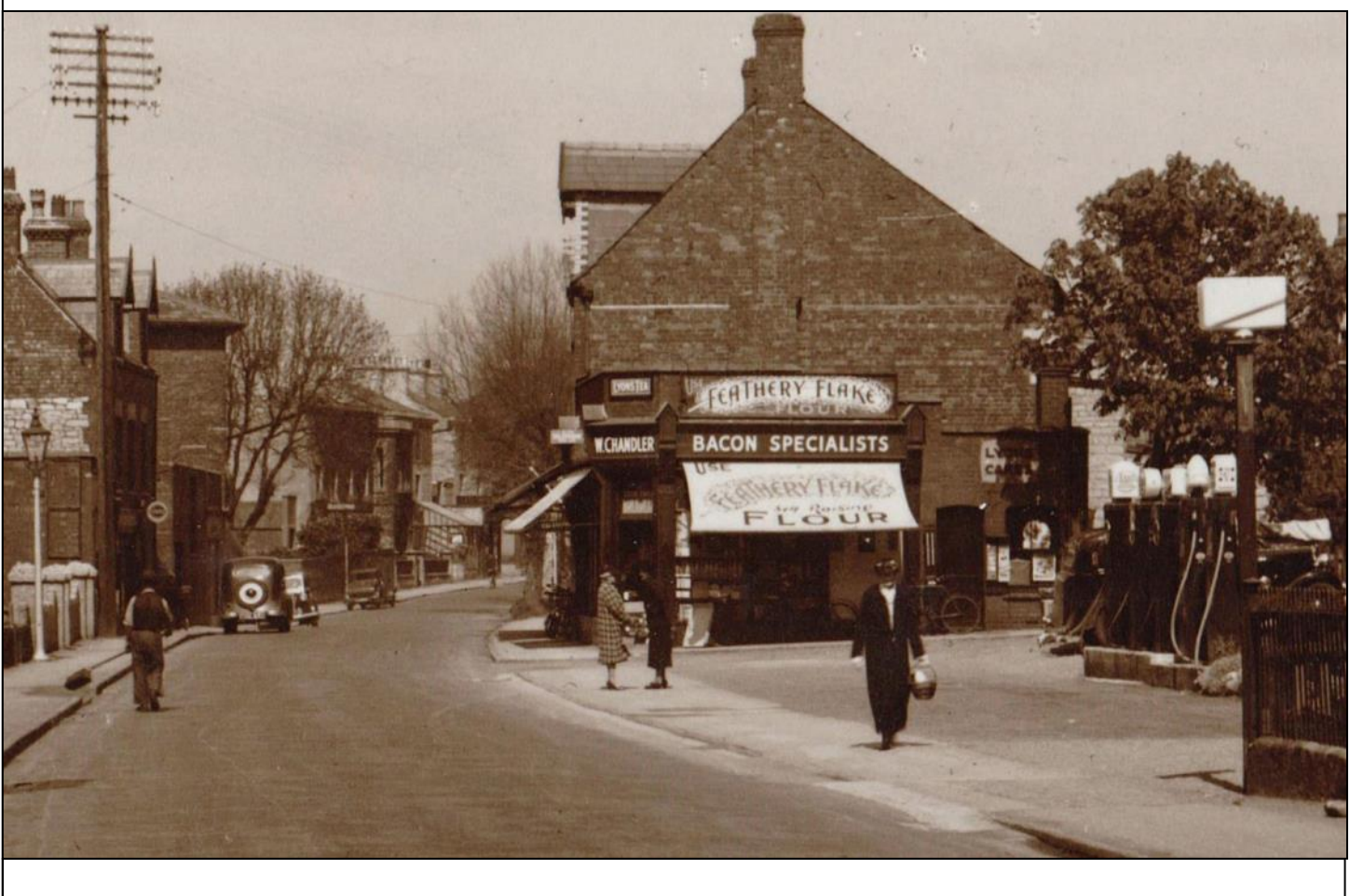
Chandler's grocery store

Stonehouse was resilient as many of the shops kept going through the war and as the men returned home new shops appeared in the village. These shops were independent and individual, and much of the fresh produce sold in them was supplied from local farms and nurseries. The three railway stations made it easy to bring in other goods from further afield, which brought people in from the surrounding area.