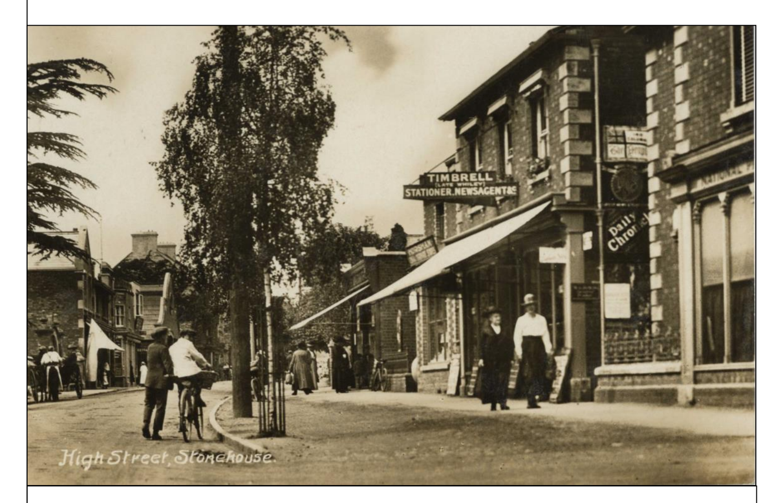
Timbrell Stationer and Newsagent